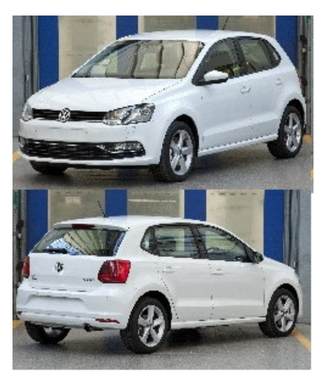
VW Polo (2014 version)