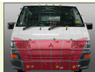
Adult leg impact (upper and full legforms)