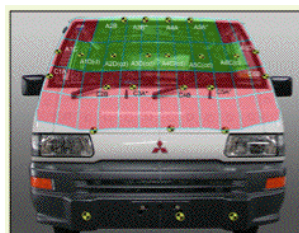
Child and adult head impact