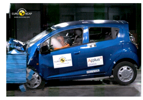
Offset crash test at 64km/h (note the rear door has a concealed door handle)