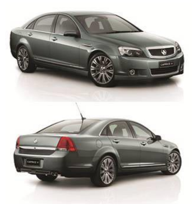
Holden Caprice WN

ANCAP tested the Holden Commodore. The Caprice has a different design of bonnet. ANCAP was provided with information which showed that the same pedestrian rating (Marginal) applies to the Caprice. (v6.0)