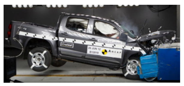
Offset crash test at 64km/h (Colorado Crew cab)