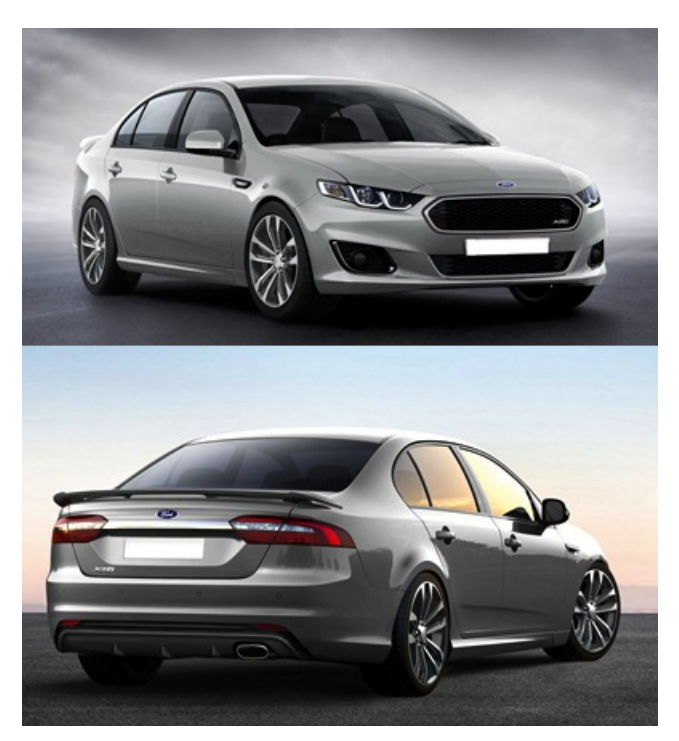
Ford Falcon FG X Sedan