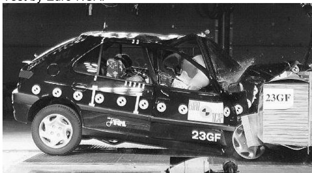
Offset crash test at 64km/h

Kerb weight: 1110 kg Vehicle built: July 1997 Test by Euro-NCAP