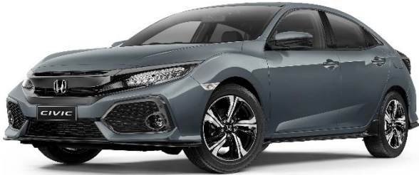
Honda Civic Hatch