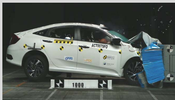
Frontal offset test at 64km/h (Honda Civic sedan)