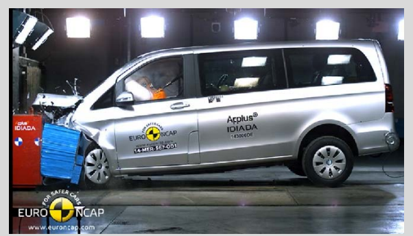
Frontal offset test at 56km/h (Mercedes-Benz V-Class)