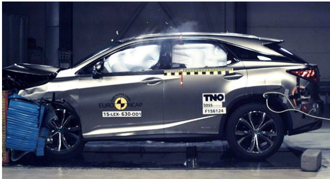
Frontal offset test at 64km/h (Euro NCAP)