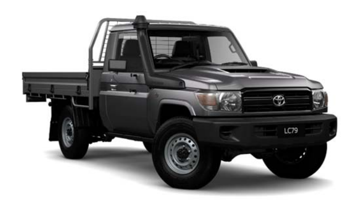
Tovota Landcruiser 70