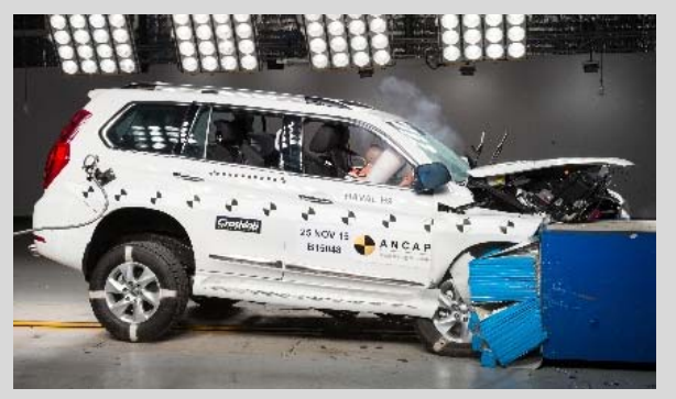
Frontal offset test at 64km/h