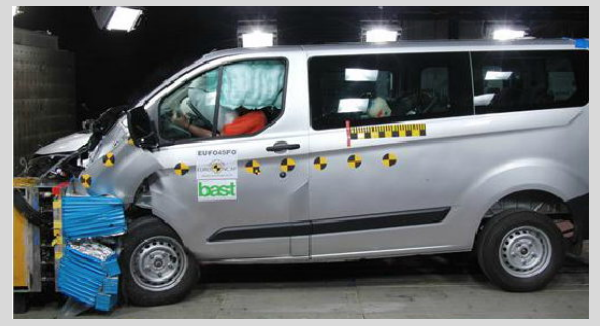
Frontal offset test at 56km/h