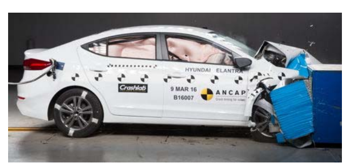
Frontal offset test at 64km/h