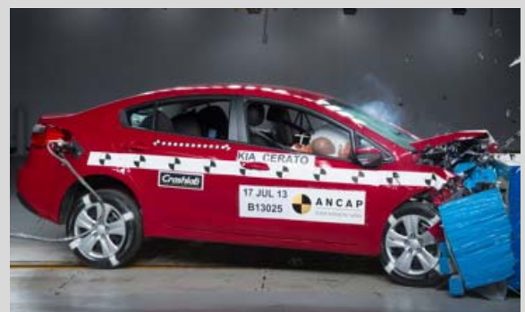
Frontal offset test at 64km/h (2013)