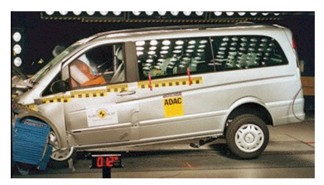
Offset crash test at 64km/h (Viano)