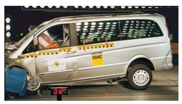
Offset crash test at 64km/h (Euro NCAP)